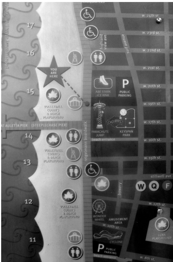
Site of iLAB 207 Coney Island Walk October 5, 2007 (Photo taken on the Coney Island Boardwalk)

Disturbance is a temporary change in average environmental conditions that causes a pronounced change in an ecosystem. Biological diversity is dependent on natural disturbance. (Production of randomness and chaos as necessary part of developing a dance)